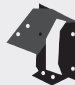
▪ CSS Multi Mount